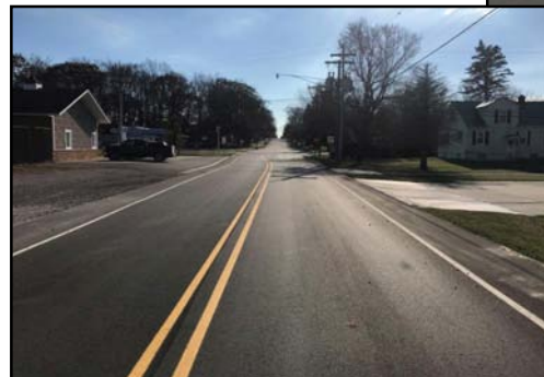
Scrap tires used in the pavement on North Fairgrounds Road (pictured at left) and Capac Road helps the environment and may save the city money over time.