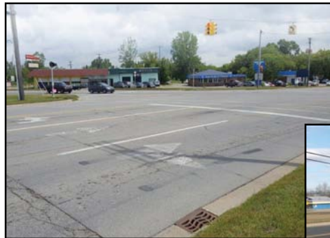
Left is Capac Road at its intersection with M-53 before completion of the project; below is after completion of the project.

The award presentation will be May 24 at the Grand Traverse Resort and Spa in Acme, MI.