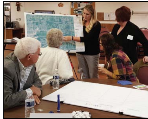
Left, ROWE helped facilitate a visioning session for residents to discuss and record their ideas for the future. Here, participants analyze an area of the city before working together to write down their thoughts about good or bad uses for that area.

The project incorporated information from a Target Market Analysis and Retail Market Analysis prepared by subcontractor LandUse/USA.