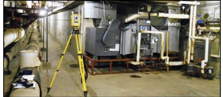
Above, utility tunnels were mapped using traditional survey methods beginning at the surface outside the tunnels, running down access stairways through the tunnels, and back out to the surface. The tunnel opening was physically measured at specified points where dimensions changed.

In addition to the 192,000-square-foot building, the survey included part of three major campus buildings, a multi-level parking structure, a section of a heavily-treed park, and 1,520 feet of underground utility tunnels.