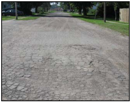
The quality of this street will be greatly improved in summer 2013.

Bituminous asphalt containing ground tires will be used in 2-3 inches of overlay on the streets. ROWE is completing design engineering for the projects, which will restore the streets' structural deficiencies, improve ride quality, and prevent the infiltration of water into their subsurface.