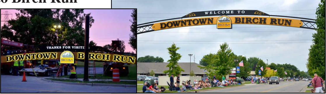
At left, the arch is assembled; at right, the arch welcomes people to the Fourth of July parade.

The Village of Birch Run, MI has a new way to welcome people to its "traditional" business district - both day and night. ROWE worked with the village's downtown development authority to design a gateway to draw customers into the district. The arch, which lights up at night, is the first part of a wayfinding system. It spans 50+ feet over Birch Run Road, just west of the entrance to the Birch Run Premium