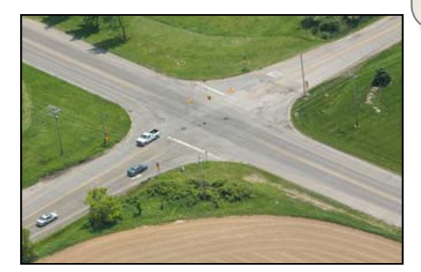
Pictured above is the intersection prior to the construction; at right is the completed project.

After discussion and explanation of the safety aspects of roundabouts, everyone was excited about the prospect of reduced severity of accidents at this location, which included 10 crashes in the last four years – resulting in three injury and one fatal.