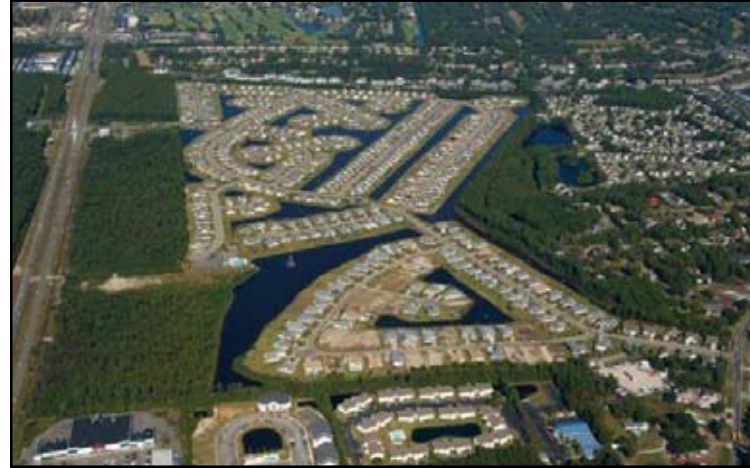
Above and at right are aerial views of the community.