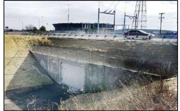
Shown above is the completed project.

The $1.2M project also included earthwork and concrete paving on Featherstone Road at Grand Trunk Western Railroad. The city is in the process of acquiring the railroad right-of-way with the goal of making it part of the local rails-to-trails system.