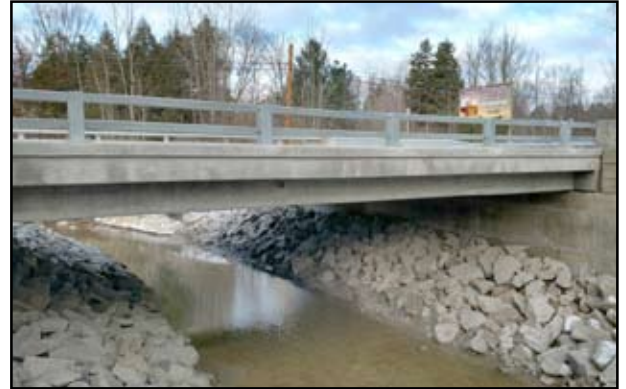
Shown above is the completed project.

Click here to watch MDOT's time-lapse video of the M-25 Bridge construction.