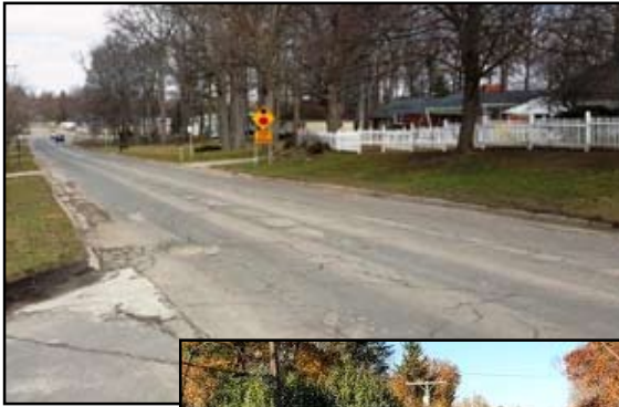
Above is a section of Almont Avenue prior to beginning the project; at right is the same area after completion.