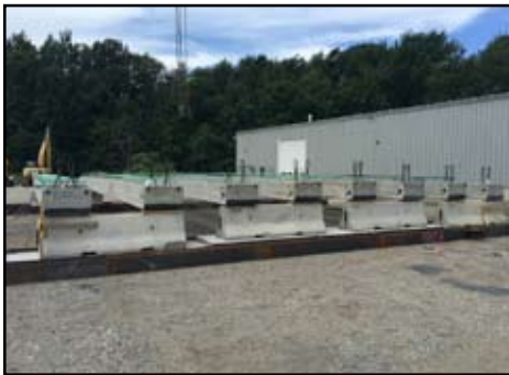
Above, precast beams are placed on temporary abutments at Anlaan Corporation's yard in Grand Haven.