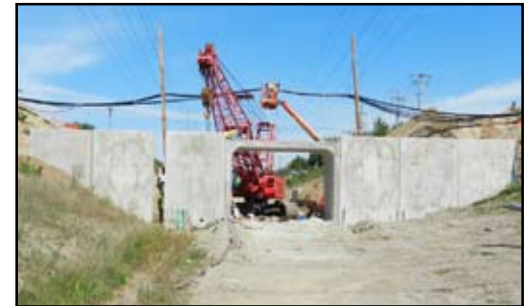
The three-span bridge over the abandoned CSX rail road line was replaced with a 16-foot by 12-foot box culvert for a future multi-use path. Dan's excavating was constrained by the transmission power lines that flanked each side of the culvert and 10 fiber optic lines that were temporarily supported by wood poles.