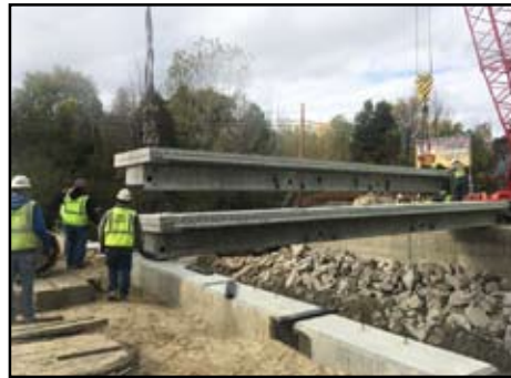
Above, precast deck segments are placed. Anlaan Corporation utilized two cranes to place the beams onto the abutments.