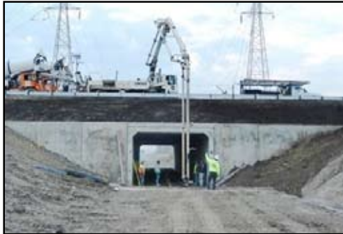
Concrete sidewalk was placed on the inside of the culvert for the future multi-use path.