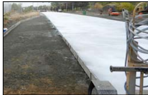
Martin J. Concrete utilized a concrete paver to place the four outside lanes of pavement on the five-lane-wide concrete roadway; the center lane was hand-paved.