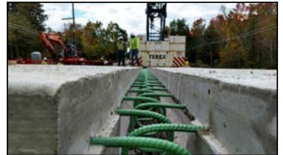
Above, the deck was designed to be diamond ground to achieve a consistent driving surface. Anlaan Corporation's construction methods yielded a finished product that fit well together. Their as-constructed tolerances achieved a finished surface that did not require the deck to be diamond ground.